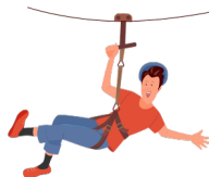
OTHER ADVENTURE ACTIVITY PARAGLIDING, RIVER RAFTING