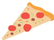
TRAVEL DURING FOOD